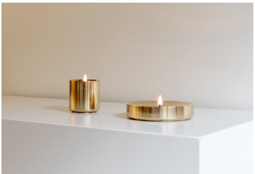
Top Dipā - Wide